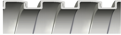
Square Locked Design 3/16" through 3/4"