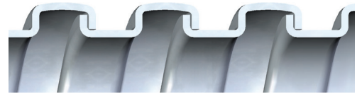
Square Lock Construction