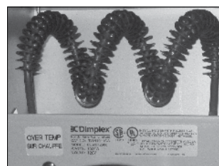
Enclosed Steel Sheathed Element Design

NOTE: Model shown with optional onboard thermostat.