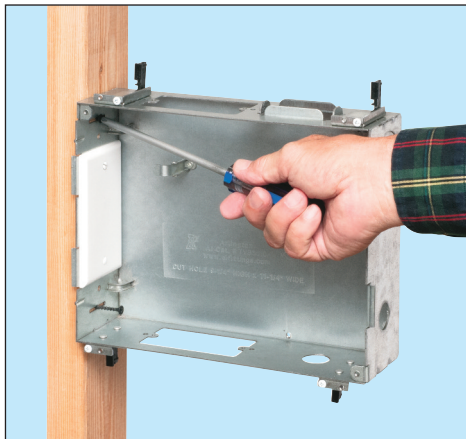
Mounts to stud in NEW work

Lots of space inside this steel box for multiple low voltage connections... and brackets for a neater installation