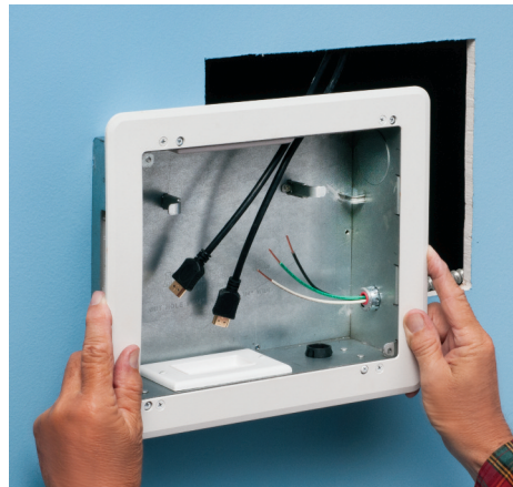
In RETROFIT mounting wing screws hold box secure in wall