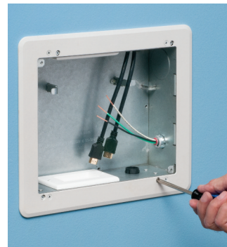
Pull cable. Tighten mounting wing screws to pull box securely against wall.