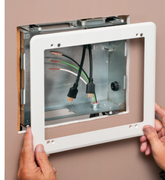
Attach plastic, paintable trim plate with screws provided.