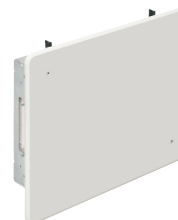
TVB810C Cover on TVBS810