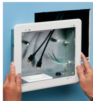
Install trim plate on box. Pull wire. Insert assembly into opening.