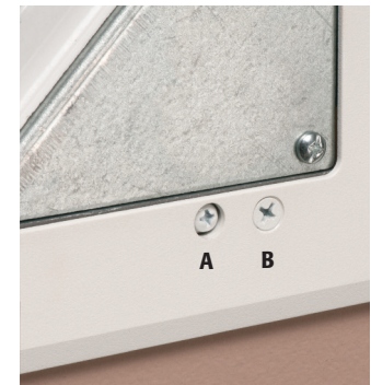
A Mounting wing screws (inside set) B Trim plate screws (outside set)