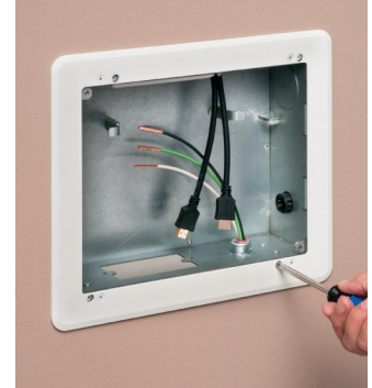
Tighten mounting wing screws to pull box securely against the wall.