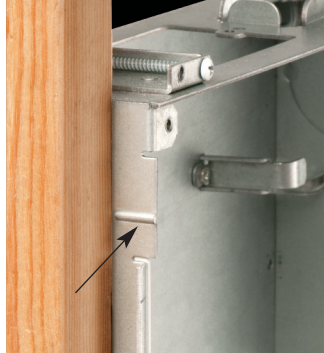
Positioning tabs are set for 1/2" or 5/8" drywall.