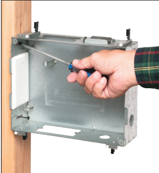
Mount box to stud, using tabs for proper positioning.