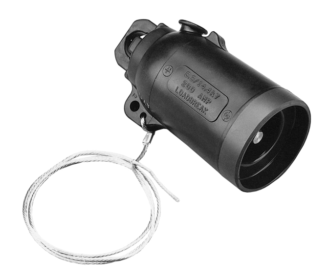
Figure 1. Insulated Protective Cap electrically insulates and mechanically seals loadbreak bushing interfaces.

To order the 15 kV Class Insulated Protective Cap Kit, refer to Table 2.