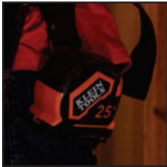
REMOVEABLE TAPE MEASURE LOOP