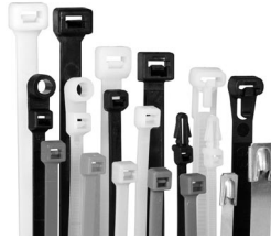
Heavy Duty Cable Ties