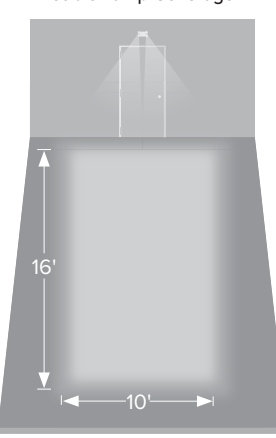
Double Lamp Coverage