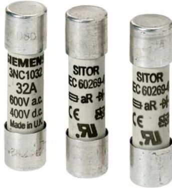
SITOR cylindrical fuse link, 10 x 38 mm, 20 A, aR, Un AC: 600 V, Un DC: 700 V, DC according to UL