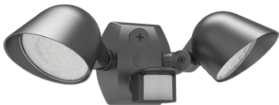
Color: Bronze Weight: 2.8 lbs