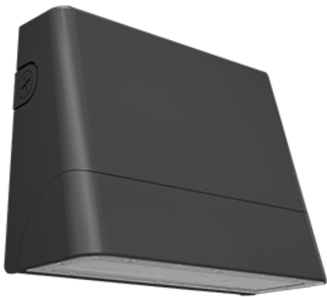
Color: Bronze Weight: 7.1 lbs