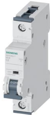
Circuit breaker Universal current 220 V DC 230/400 V AC 10kA, 1-pole, C, 2A